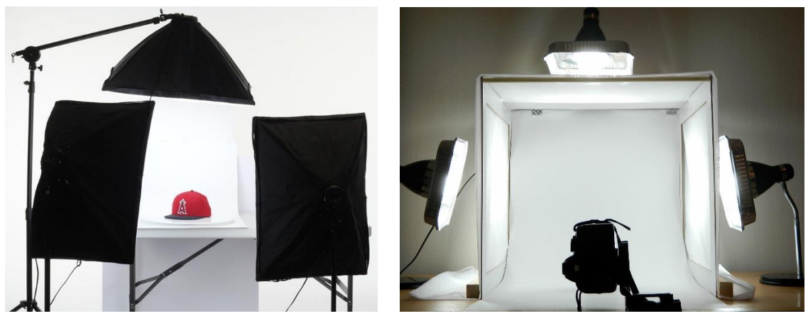
Figure 1. Example of diffuse lighting setups using commercial softbox lighting (left), or a homemade lightbox with diffuse walls (right).