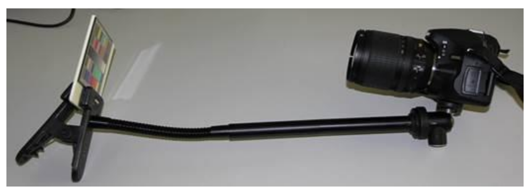
Figure 2. Example fixture used for the side-by-side image capture method.

obtain and hold that white balance setting. Omit this step if the camera does not have incamera white balance capability.